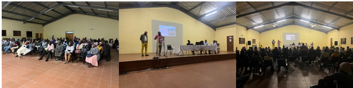
Budget..... The 2023 Budget Consultation meeting on 15 th May 2023. The meeting received a great turn out from the community.