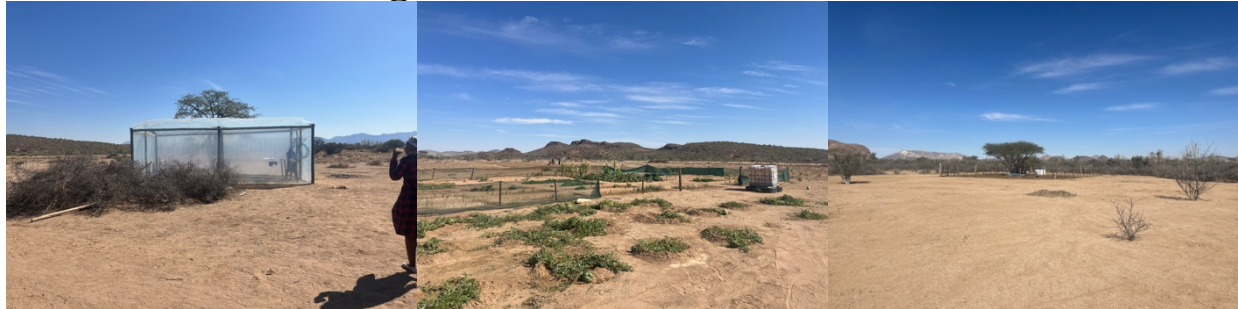
Agriculture.... The KayTjiUndj Trading has started construction of a temporary green house in order to grow their own seedlings.