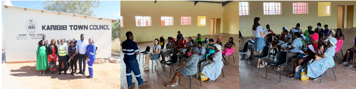
First Picture: Karibib Town Council and Usakos Town Council meet to discuss collaborations with the two towns. Second and Third Pictures: The Safe Food Handling and Financial Management training with the Early Childhood Education teachers.