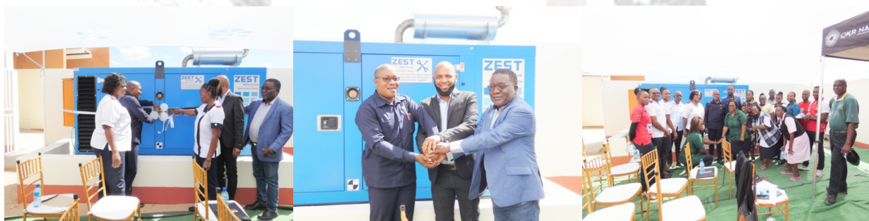
On 27 th March 2023 QKR Namibia Navachab Mine unveiled a new generator that they donated to the Karibib Health Centre. The Karibib Health Centre now has a generator and will continue to have power to treat patients if a blackout occurs.