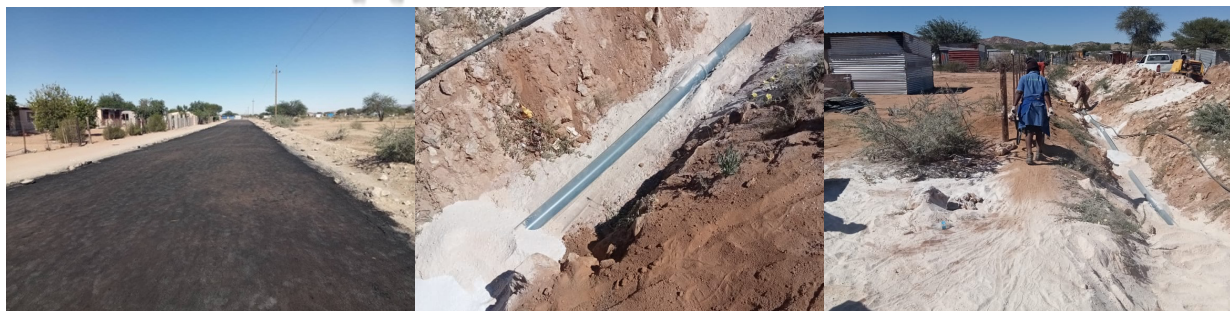
First Picture: Upgrading of road in Usab Proper from gravel to bitumen. Second and Third Pictures: Karibib Town Council temporary workers laying the pipes for Water Reticulation in Harambee.